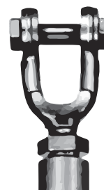
JAW WITH LOCKNUT