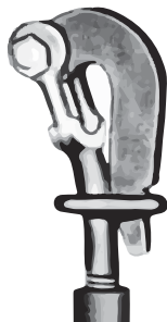
ANGLE SHANK PELICAN HOOK ASSEMBLY