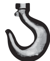
SWIVEL OR THREADED SHANK HOOK