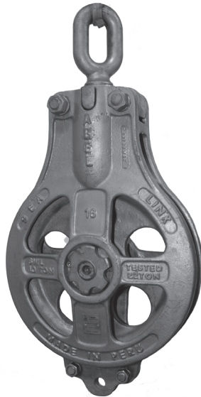
DRILLED SWIVEL EYE